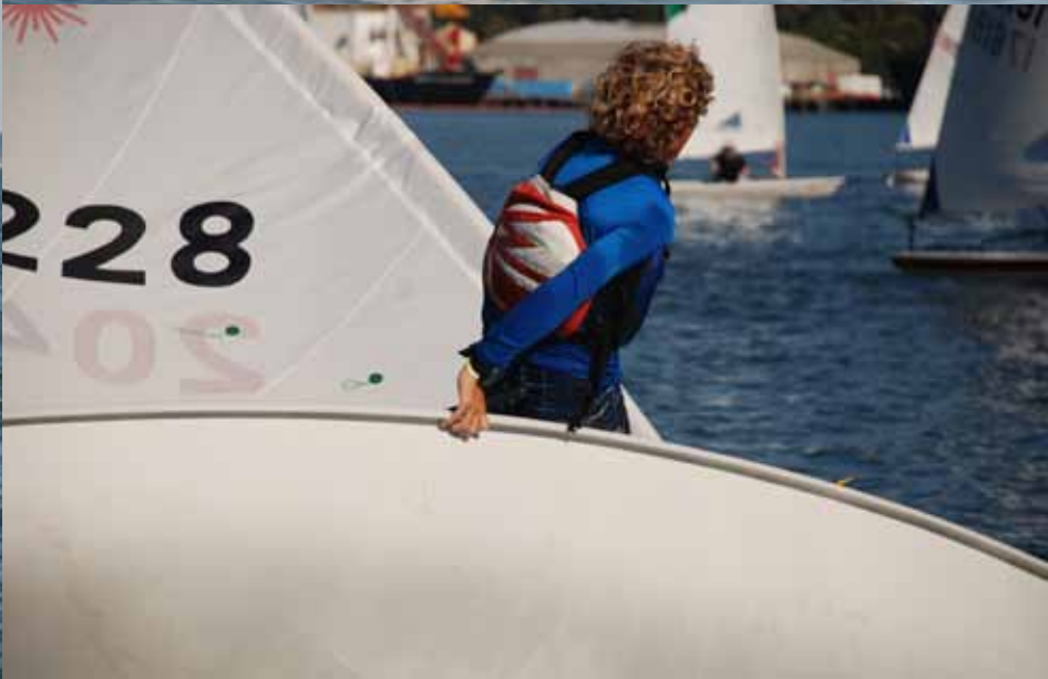
Bellingham Youth Regatta